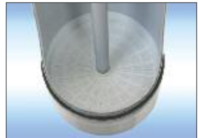
Vortech™ Mineral Tank

Standard tanks use gravel under bedding, which adds weight and cost. Also, re-bedding is more difficult, should riser tubes pull out of the gravel bed.