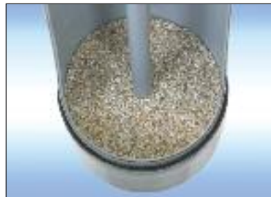
Standard Mineral Tank

Standard tanks use gravel under bedding, which adds weight and cost. Also, re-bedding is more difficult, should riser tubes pull out of the gravel bed.