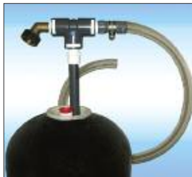
Extraction Tool (P/N: D91EXT)

Tri-Plex conditioners come with a five year limited warranty on control valves, mineral tanks and brine tanks. For more details please refer to our owners manual.